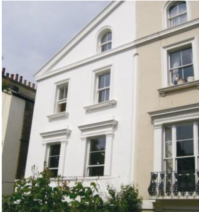
Just like new