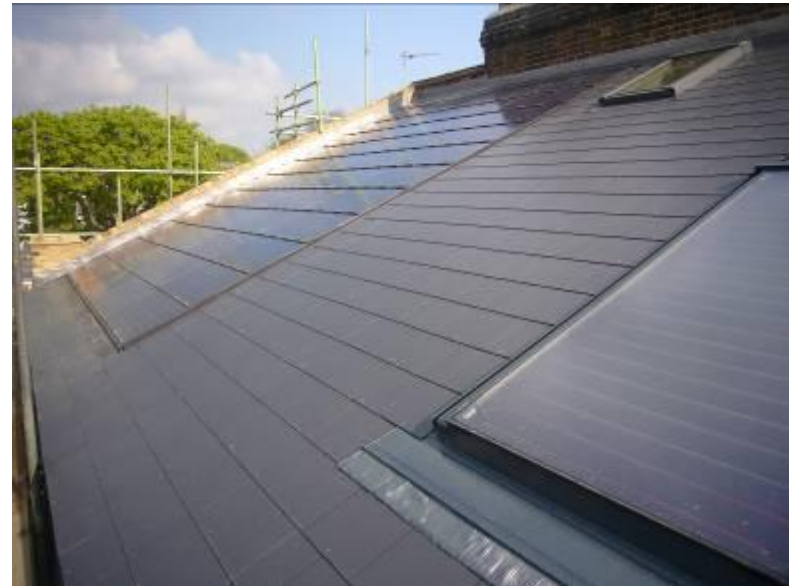
With renewable additions